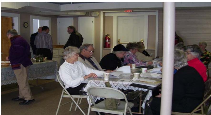
Photo taken at the Bartlett Church Annual Meeting January 10, 2010